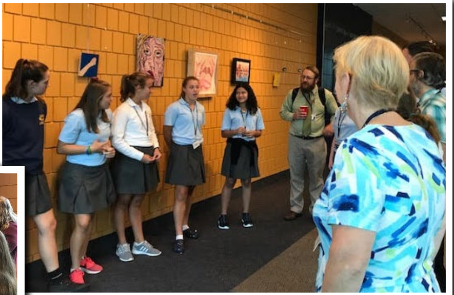
First Quarter Club Leader Meeting Pics